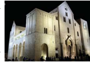
Basilica of San Nicola

Before we bid arrivederci to Bari, we visit the church of San Nicola (Basilica) and celebrate Mass there (subject to confirmation). It was built in AD 1087 but not completed until 1197. Beneath the altar are the remains of St. Nicholas. From there, we stop in the heart of the city to visit the Cathedral of San Sabino, which houses mortal remains of St. Sabinus preserved in the crypt. St. Sabinus was Bari's original patron saint. Next, we travel west to Naples to visit the Museo Archeologico Nazionale where we will see the contents of the now empty structures of Pompeii. Naples is the birthplace of pizza so after the museum, we will stop at a local pizzeria for a group dinner before we check in at the hotel. Overnight in Naples.