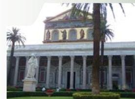
St. Paul Outside the Walls

This morning we visit the Vatican Museum, Gallery, Raphael's rooms with the wonderful frescoes, and the Sistine Chapel, where Michelangelo's restored masterpieces adorn the ceilings and walls. From there we enjoy a guided tour of St. Peter's Basilica. The Basilica is very impressive with its imposing architecture, rich ornamentation, and marvelous works of art. We view one of Rome's most recognized works of art, Michelangelo's Pietá. Next, we visit the Rome's second largest church, the Basilica of St. Paul Outside the Walls, a beautiful basilica which houses the remains of St. Paul under the main altar. We continue on the Old Appian Way to the Catacombs of St. Calixtus, passing Quo Vadis along the way. We return to our hotel for a farewell dinner and overnight.