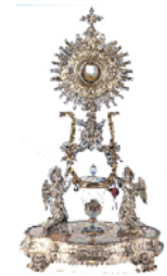
Eucharistic Miracle (Lanciano)